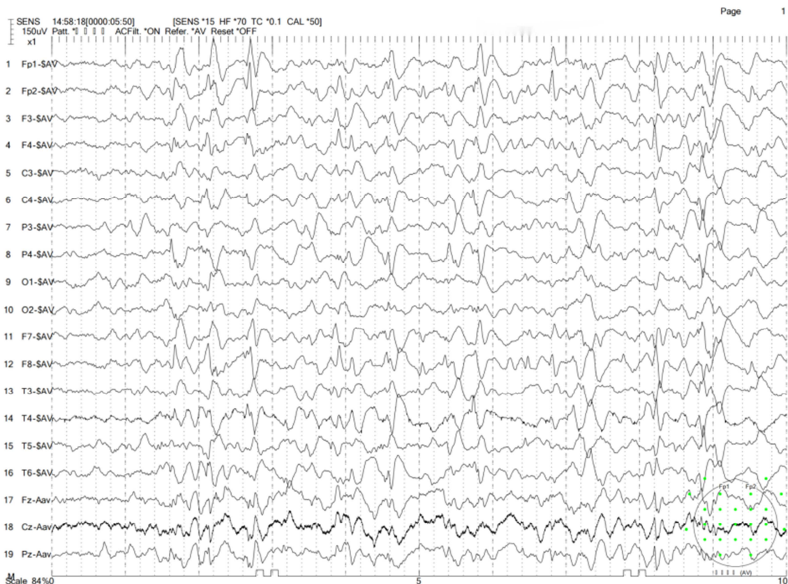
Figure 3. EEG shows bilateral asymmetry in brain waves. Consideration of abnormal EEG patterns for the age group and possible medication-induced sleep EEG abnormalities.

This case study illustrates the potential neurological damage and the importance of rehabilitation therapy after infection with the novel coronavirus, providing valuable information for clinical practice and scientific research. However, the limitations of this case are noteworthy. It is a single case and cannot represent all situations of neurological damage after infection with the novel coronavirus. Furthermore, it cannot determine the exact mechanisms of neurological damage and the optimal rehabilitation therapy for such cases. More cases and research are needed to validate and refine these findings.