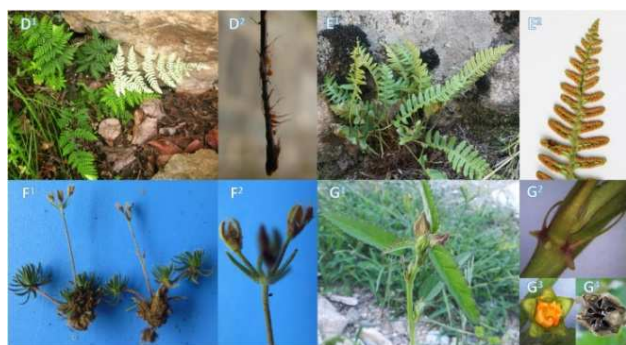
Figure 2. Four newly recorded species from Beijing, China. D. Aleuritopteris grisea (Blanford) Panigrahi; E. Polypodium sibiricum Sipliv.; F. Androsace incana Lam.; G. Sida spinosa L.

A small fern with creeping rhizomes. Fronds remote; lamina oblong-lanceolate in outline, deeply pinnatifid or pinnatisect, glabrous; segments 12–16 pairs, spreading, narrowly lanceolate, 2–2.5 × 0.5–0.6 cm, usually decurrent to